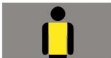
Plassansvarlig – brann Local Fire Warden