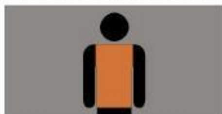
Brukerrepresentant – brann Fire Warden – building