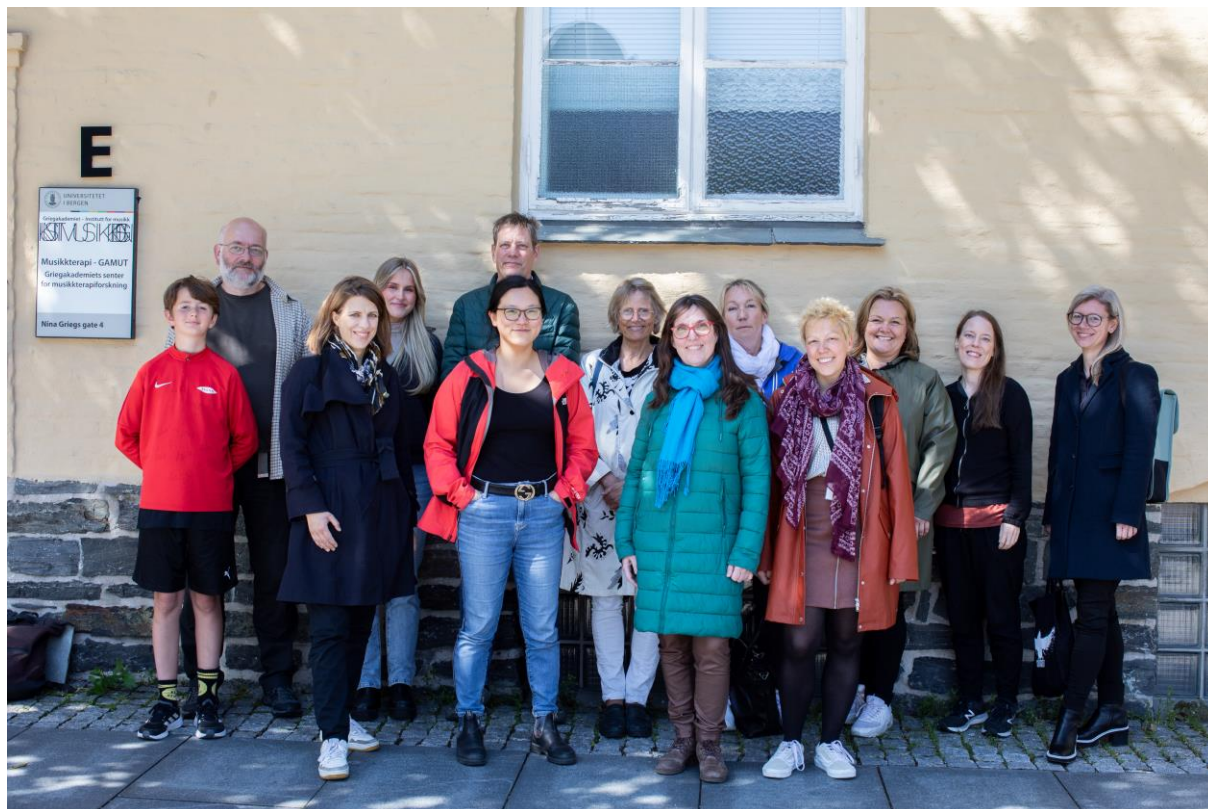
FALCO project group, 2024