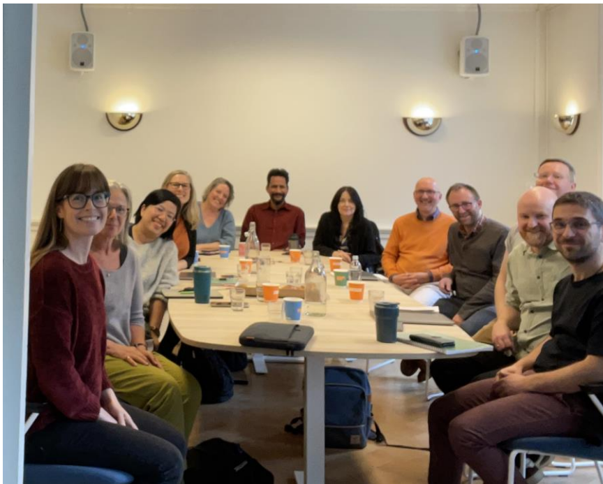
RESEARCH SYMPOSIUM - Insider Music UIB, Bergen - October 7, 2024