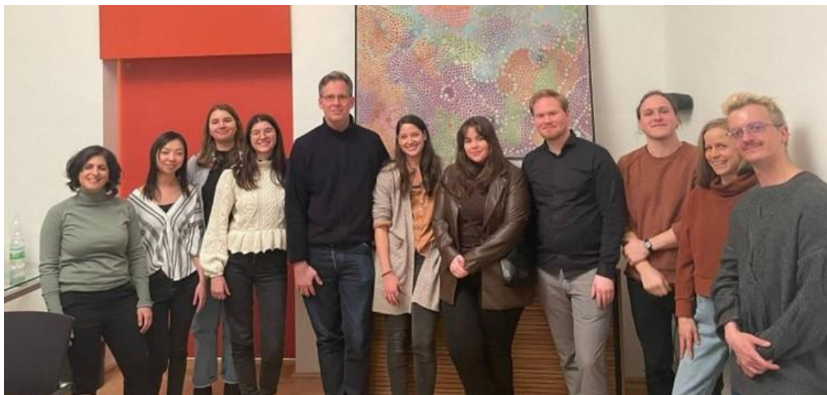
Music4Autism project