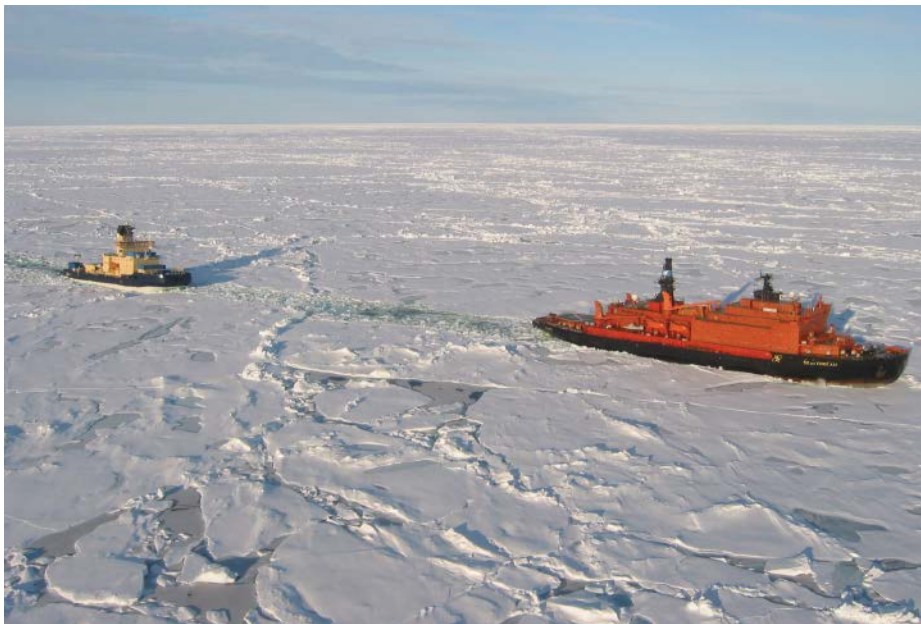
In this 2007 photo, the Swedish icebreaker Oden (left) runs a seismic cable in the wake of the Russian nuclear-powered icebreaker 50 Let Pobedy, which is plowing through heavy ice north of Greenland. The Synoptic Arctic Survey team plans to launch a coordinated multinational campaign using icebreaker ships to gather data in the Arctic Ocean beginning in 2020.

Since the International Polar Year (which actually lasted from 2007 to 2010), two truths about the changing Arctic have emerged. First, the ongoing rapid transformation of the Arctic environment will continue for decades, regardless of future global carbon dioxide (CO 2 ) emission levels. Second, the scientific challenges and consequences arising from this transformation are too large to be addressed by a single country alone and too complex to be properly understood through single-discipline research approaches.