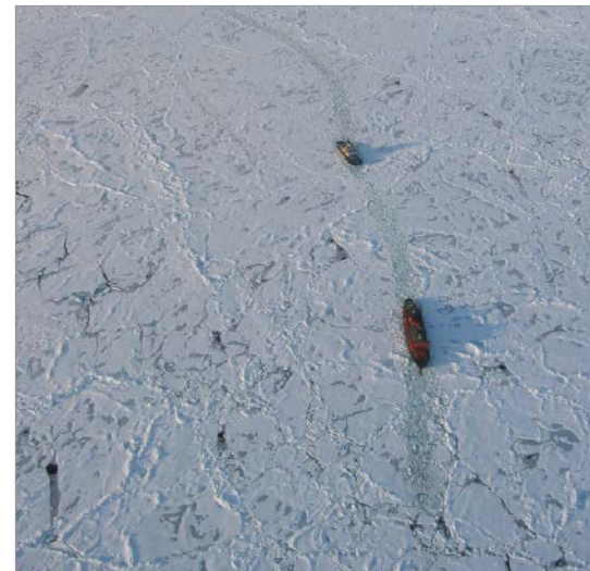
In heavy sea ice conditions, a powerful icebreaker becomes a necessity. This aerial view shows the smaller Swedish icebreaker Oden following the Russian nuclear-powered icebreaker 50 Let Pobedy.

Yasunaka, S., et al. (2018). Arctic Ocean CO 2 uptake: An improved multi-year estimate of the air-sea CO 2 flux incorporating chlorophyll- a concentrations, Biogeosciences , 15 , 1,643–1,661, https://doi.org/10.5194/bg-15-1643-2018 .